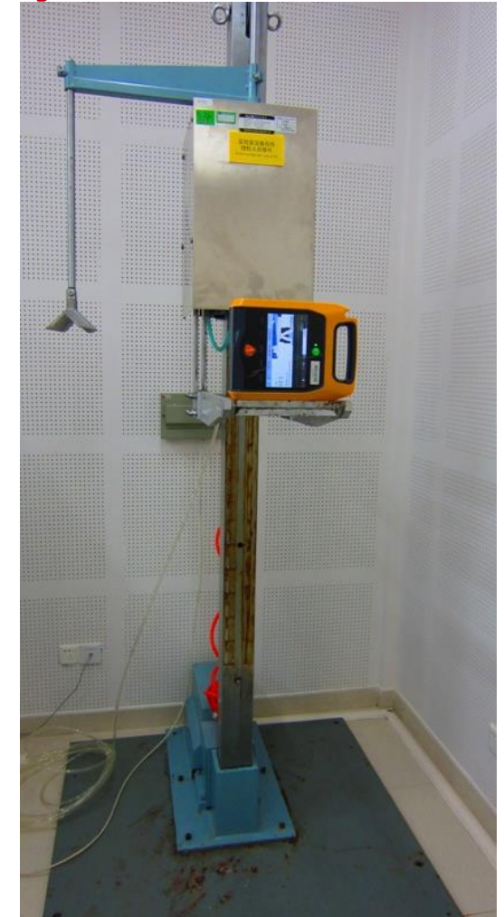
Drop test (1.5 meters)