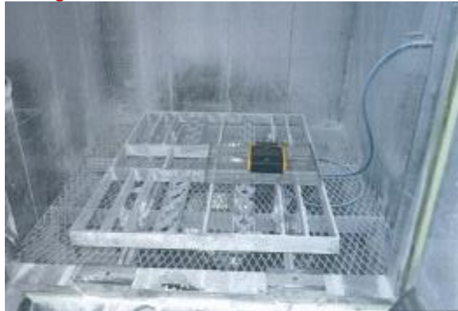
IP5X test (Dust proof)