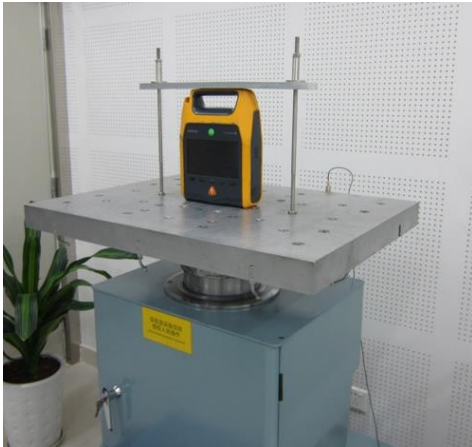
Bump and shock test